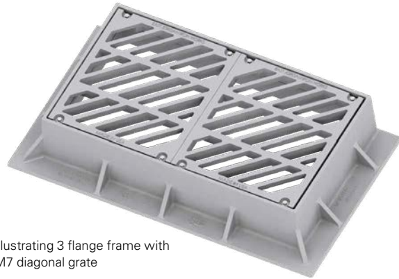
Illustrating 3 flange frame with M7 diagonal grate

Options Available with 3 or 4 flange frames Bolted assembly Adjusting risers Steel grates T1 4' hood